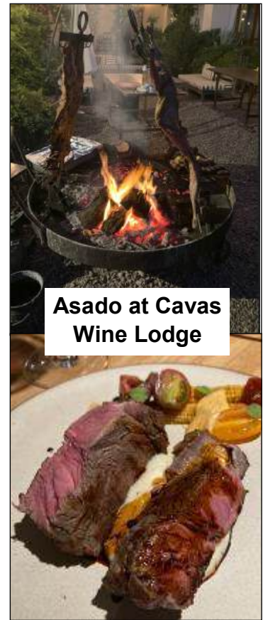
Asado at Cavas Wine Lodge

There's not enough space to go into massive detail but to sum up the trip, reminiscent of one of those slightly cruel Japanese TV game shows, one where weary contestants roll into a mini-bus, trundle over to the morning winery, wander around a desiccated field for a bit, then swill & spit gallons of tannic red, then have kilos of flame-grilled meat (and perhaps one cherry tomato for balance) pitch-forked into their wine-stained faces, then do it again at the afternoon winery, but then repeat for 9 days straight.