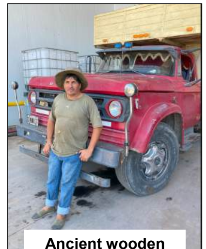
Ancient wooden truck - Los Haroldos