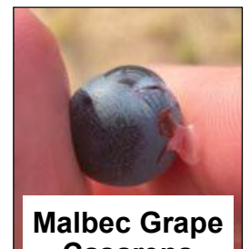
Malbec Grape Casarena

Spare a thought for the wine-makers in a region where there exists a monstrous mountain wind called the Zonda which without warning can flow down from the peaks, pushing the air from a gentle breeze to 150 miles an hour in literally seconds, blowing roofs of wineries, decimating trees and ruining your newly-set perm. Yikes.