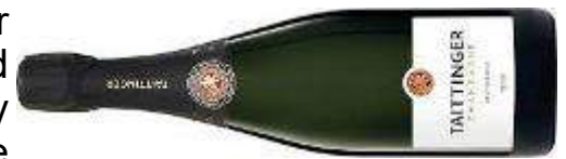
Taittinger Brut NV, £46.49

In this beautiful setting we had the privilege of sitting down and sipping Taittinger NV, Taittinger Brut millesime' 2016, Taittinger Comtes del Champagne Blanc de Blancs 2013 and Taittinger Rose'. All of the wines were characterised by their light, delicate and fruity flavours, as results of the blending and tasting work that the Taittinger family has been doing since 1734.